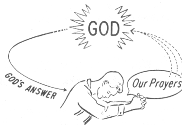
God hears and answers the prayers of His children.

"...ask, and ye shall receive, that your joy may be full." John 16:24