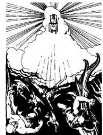
We claim Christ's victory over Satan.

Though Satan is defeated, he has not yet been cast into the lake of fire. For the time being, he is free, and he is working as hard as ever to keep unsaved people in his kingdom.