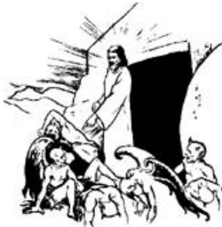
Christ defeated the powers of darkness

When the Lord Jesus lay in the tomb, Satan thought he had won the victory. But, on the third day, the Lord Jesus arose -- Victor over all the powers of darkness. Satan knew then that he was defeated.