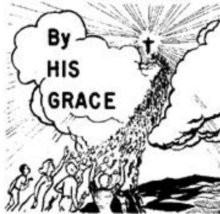
We shall be caught up by His grace.

What about this? Will we be caught up to meet the Lord by our own power? No, not at all. It will be by God's mighty power. It will be by His grace.