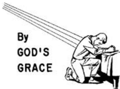
We were saved by God's grace.

"For by grace are ye saved through faith; and that not of yourselves: it is the gift of God." Ephesians 2:8