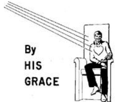
We "reign" in this life by His grace.

"... they which receive abundance of grace and of the gift of righteousness shall reign in life by One, Jesus Christ." Romans 5:17b