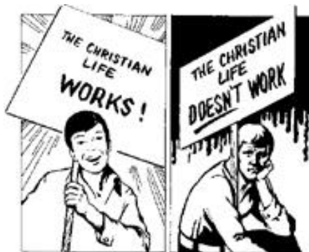
Which are you saying?

"It we say that we have no sin , we deceive ourselves, and the truth is not in us." I John 1:8