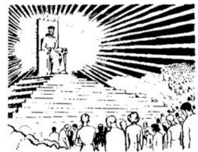
Christians will be judged.

At the judgment seat of Christ , we will be judged for what we have done after we were saved. This will be a solemn occasion for all believers.