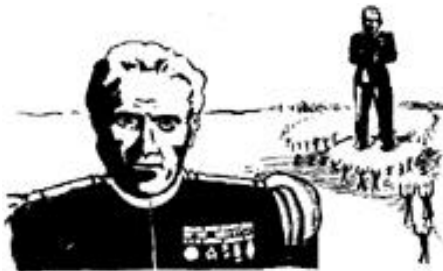
The Antichrist will rule the world.

Through deceit and his miraculous powers, Satan's Antichrist will gain control of the whole world. No one will be able to buy or sell without his mark. He will set up a great image and require people to worship him and his image. Those who refuse to do so will be killed.