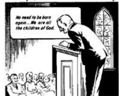
"...in the latter times some shall depart from the faith...." I Timothy 4:1

There is great apostasy in many churches also. Many ministers who claim to be servants of Christ no longer preach the gospel. They no longer preach that men are lost sinners and need to be saved through faith in blood of Christ. Instead, these men deny the necessity of the new birth and preach that God is the Father of all men and that all men are brothers. The Bible says, "From such turn away."