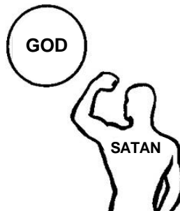
Satan rebelled against God.

"I will ascend into heaven, I will exalt my throne above the stars of God: I will sit also upon the mount of the congregation ... I will ascend above the heights of the clouds; I will be like the most High." Isaiah 14:13,14