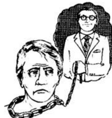
Hatred makes you a slave to the person you hate.

The moment I start hating a man, I become his slave. I can't enjoy my work any more because he controls my thoughts. My resentments produce too many stress hormones in my body and I become fatigued after only a few hours of work. The work I formerly enjoyed is now drudgery. Even vacations cease to give me pleasure.... I can't escape his tyrannical grasp on my mind. 1