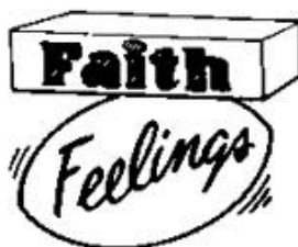
Don't put your faith in your feelings

Many sincere people seek for salvation but they do not find it because they are looking for some kind of feeling. Feelings do have a place in the Christian life, but they do not come first. Instead, they follow facts and faith. The Bible says, "He that believes on the Son has the witness in himself." Note the order: First, we believe; and then we have the witness of the Spirit in our heart.