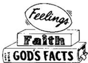
Feelings follow facts and faith

The lady pointed to some verses in God's Word and said, "Here's all the light you need." The girl put her faith in God's Word and found the peace and joy she had been seeking.