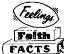
God's order is: Facts, faith, feelings

Others try to put faith first. They think that if they have enough "faith," they can make anything come true. But this is not God's way either. God wants us to have faith, but our faith must rest on His Word; otherwise it is of no value.