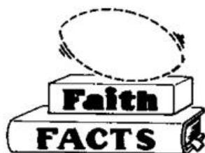
Faith rests on God's facts

As important as faith is, it can not stand alone. It must rest on something, and that "something" must be true. This is why our faith must always rest on God's Word, Jesus said, "Thy word is truth."