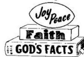
We have joy and peace in believing

God's order is always: (1) Facts, (2) Faith, and (3) Feelings. Facts form the foundation; faith rests on facts; feelings come last.