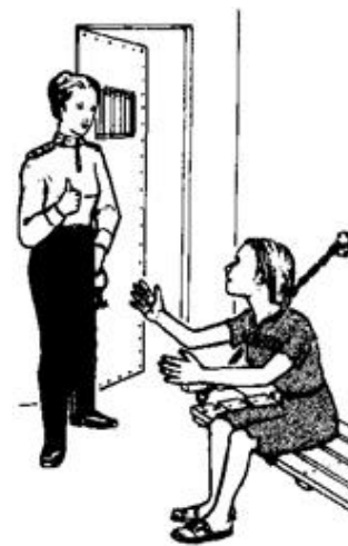
"I stretched out my hands toward her. We embraced each other, and began to cry. Now we pray together."