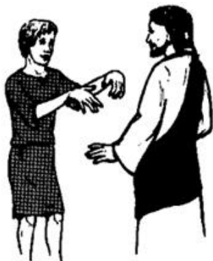
As the man with the withered arm obeyed the Lord, God's power flowed into him, enabling him to do what he could not do before.

Sometimes God works a miracle when we go to see a person and talk with him. We often find, to our surprise, love swelling up in our heart for that person. Jesus told the man with the withered arm to stretch forth his arm. As he obeyed the Lord, he found God's power flowing into him, enabling him to do what he could not do before.