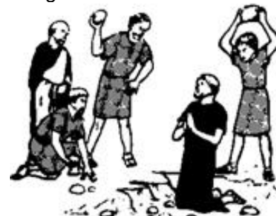
God's AGAPE love enabled Stephen to pray for his enemies.

It was AGAPE love that enabled the first martyr, Stephen, to pray for very men who were stoning him to death.