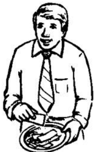
God loves a cheerful giver

so let him give; not grudgingly, or of necessity: for God loves a cheerful giver." 2 Corinthians 9:7