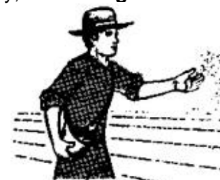
Giving is not throwing money away; it is sowing.

Giving is not throwing money away; it is sowing . When we sow