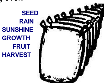
God gives generously.

When God gives, He give bountifully. He is very generous. In Jesus' time, people bought their grain in bulk. Many sellers would pour the grain into a measure without allowing the buyer to shake it down. Not so with the Lord. He gives "good measure, pressed down, shaken together, and running over."