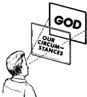
Faith looks beyond circumstances and discovers God at work.

In our situation, when we choose to "walk by sight," we see only our circumstances. But, when we choose to "walk by faith," we look beyond our circumstances and discover God at work.