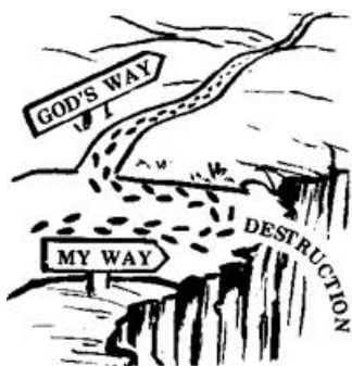
"I thought on my ways, and turned my feet unto Thy testimonies." Psalm 119:59

"I thought on my ways, and turned my feet unto thy testimonies." Psalm 119:59