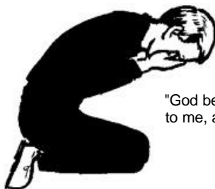
"God be merciful to me, a sinner!"

"Let the wicked forsake his way, and the unrighteous man his thoughts: and let him return unto the Lord, and He will have mercy upon him; and to our God, for He will abundantly pardon." Isaiah 55:7