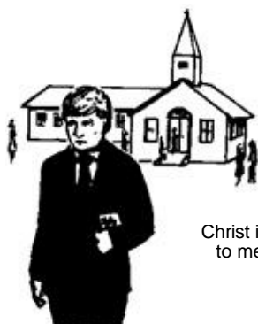
Christ is not real to me. Why?

As for those who are truly born again, the reason Christ is not real to them is that they are grieving the Holy Spirit.