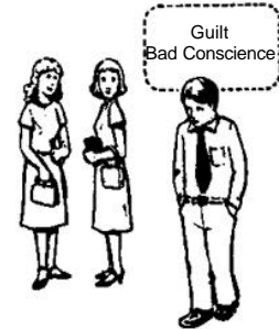
When we do not obey our conscience we damage our spiritual life.

It is most important that we keep a sensitive conscience. If we are careful to obey the voice of our conscience, it will be kept clear and sensitive. If we do not