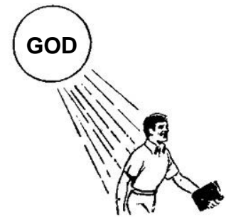
We maintain a clear conscience by walking in obedience to God

We maintain a clear conscience by walking in obedience to God.