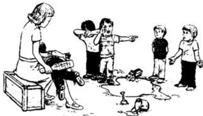
A mother chastens her own children

The first thing we need to see about chastening is that it is proof that we are God's child. God does not chasten unsaved people. He chastens only His own children.