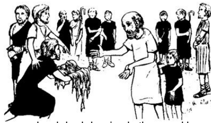
Jacob had deceived others and he himself was deceived

For twenty years Jacob was cheated by his uncle. During this time, Laban changed his wages ten times. Eventually, Jacob left the land of Haran to return to his home. During the journey, Rachel became sick and died.